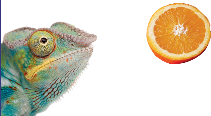
Dimensional Print Samples

Fineline is a full service graphics company, which means we have a dedicated pre-press and technology staff to make sure your files will produce what you want. With the help of our mailing and fulfillment facility, Fineline handles daily, weekly, and monthly communication on behalf of its customers--with no interaction besides obtaining the distribution lists.